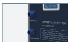
Tap water / ozone water interface