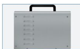
Stainless steel body