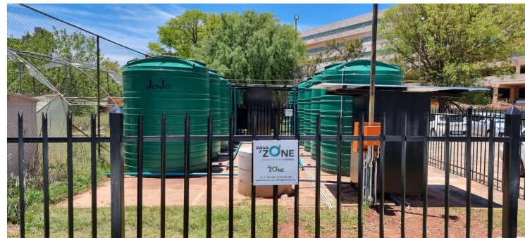
BIOZONE MANUFACTURING // Corporate profile