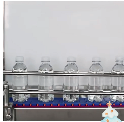
Automated bottling line designed for efficiency and sustainability.