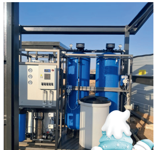
Providing over 900 students with access to safe, clean drinking water.