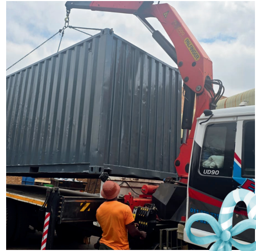
Providing a large scale shopping complex with access to safe, clean drinking water.