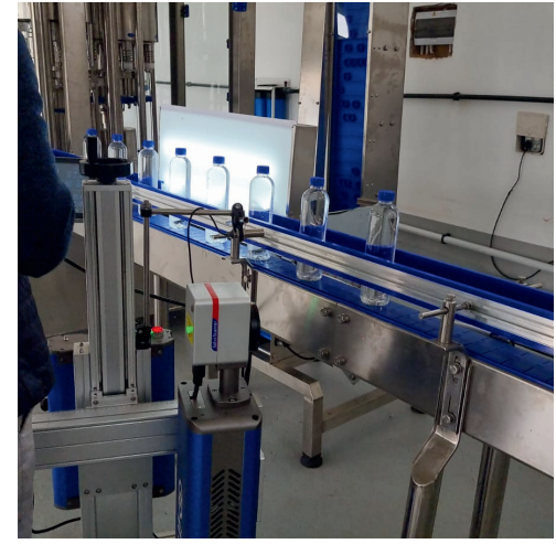
Automated bottling line designed for efficiency and sustainability.